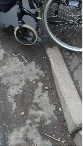
Footway, Carriageway and dropped kerb at Victoria Road