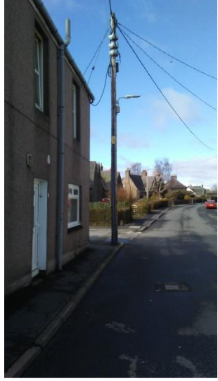
Footways on Commercial Street