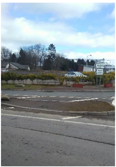
Crossing island on Station Road

• The crossing point at the end of Station Road at the roundabout with Burnside Road is difficult if you are a wheelchair or mobility aid user. Crossing the road involves a narrow island, with dropped kerbs, in a busy road very close to a roundabout. This would be the main route for residents and visitors to the care home to access the town centre, so there may be several people with mobility aids or in wheelchairs trying to cross at one time. The volume of traffic is quite high, with a large proportion of heavy goods vehicles, which is intimidating and noisy, especially if the pedestrians are not able to move quickly. The crossing would be improved by increasing the island width or adding a zebra crossing.