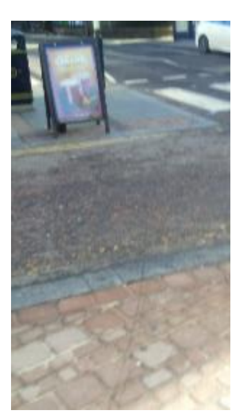
Advertising board on Union Street

There is a short 30mph sign on a bollard on the footway on Burnside Road. This obstructs the footway and is a trip hazard for pedestrians. As it is low and fairly small it will also be less visible to drivers.