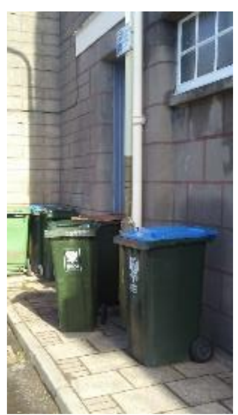
Wheelie bins on footway

The space in George Square has been recently upgraded. The footways are well maintained but there is only one dropped kerb at the amenity housing. When on the audit there was a car parked across the dropped kerb blocking the entrance to the housing. There were also wheelie bins obstructing the footway.