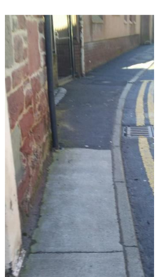
Footways along George Square and Causewayend