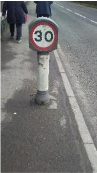
30mph bollard on Burnside Road