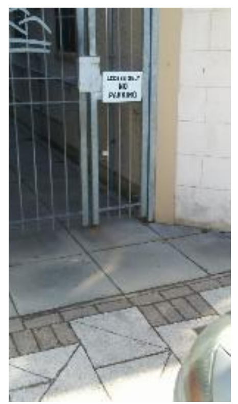
Parking in George Square in front of amenity housing access

Auditors said they felt that vehicles travelled too fast along George Street and Union Street. They said this was most noticeable around the zebra crossing.