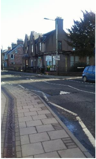
Speed bumps on Union St