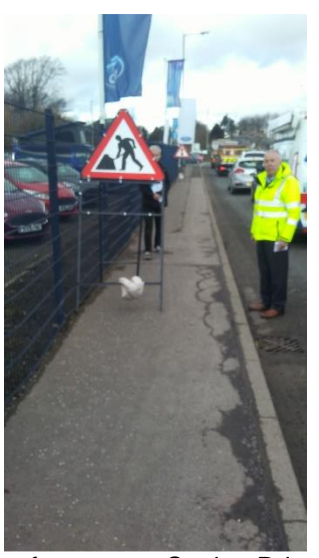
Poor footway surface on Station Road