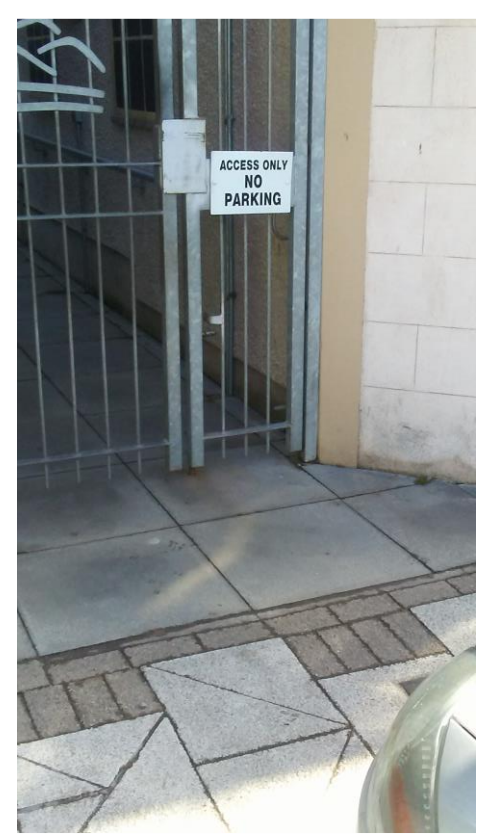
Car parked across dropped kerb and entrance