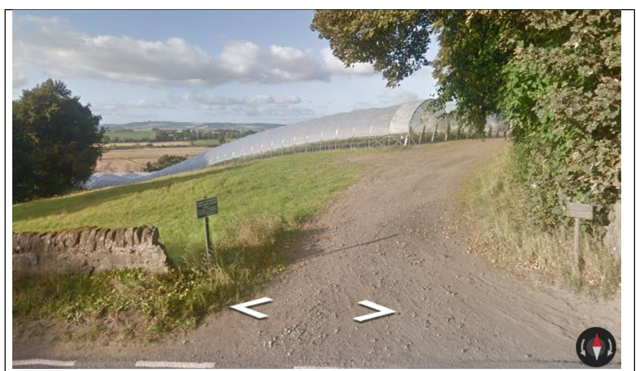
Western end of path as shown by Google Streetview.